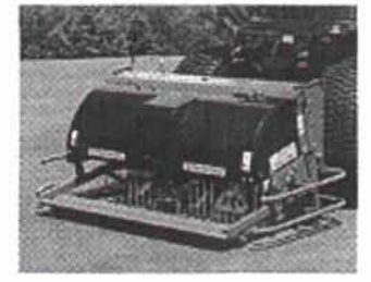
Terra Spike Deep Tine Aerator