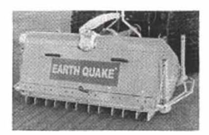
Earth Quake<sup>®</sup> Soil Decompactor

Serving The Turf Industry For Over 20 Years!