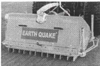
Earth Quake® Soil Decompactor

Serving The Turf Industry For Over 20 Years!