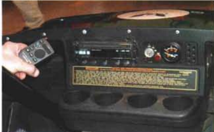
One idea picked up from the tour—in-dash CD player with remote for the utility vehicle of the future.