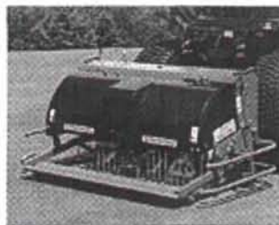
Terra Spike Deep Tine Aerator