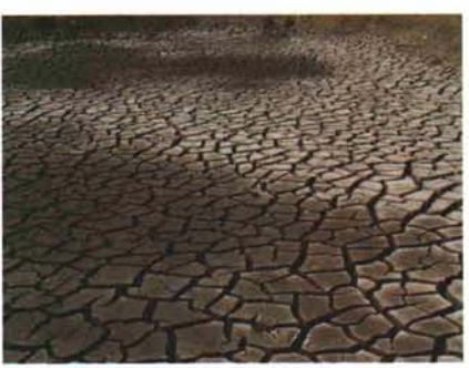
A typical irrigation pond this past July.

For starters, a word about the weather we have been experiencing this summer (as of mid-July): Enough! Hopefully by the time this reaches you, our drought has been broken, your rough is green once again, and you are wearing a wind shirt in the mornings to stave off the cool breezes. Right. As this is being written, hurricane Dennis veered away to the east and left us high and dry, and my patience—especially with the Weather Channel-has been stretched to the brink. Here's hoping for better days, raging rivers and recharged aquifers.