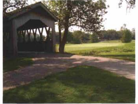
How many times do you get back-to-back issues featuring the same covered bridge?