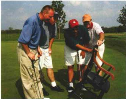
"Sure would look good with my name on it!"