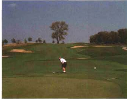
Gary Hearn chips onto no. 6 green while one of the majestic cottonwoods looks on from the distance.