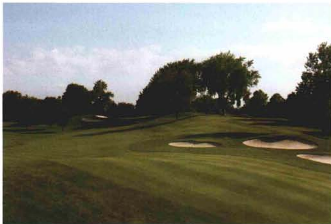
There really IS a reason it's called Oakland HILLS—hole no. 11 for example.