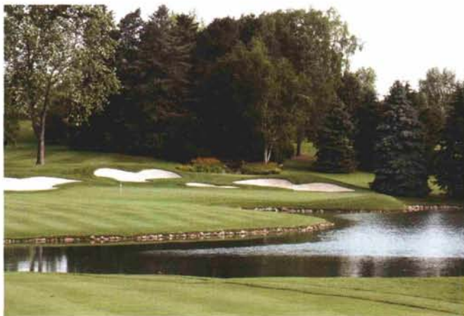
The notorious 16th hole.