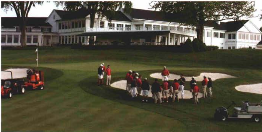
Bunker Raking 101 being taught on the 18th green with the famous clubhouse in the background.

'Tis the season for the various golf leagues to hold their final hurrahs and disband for the winter (or at least segue from golf to another, more cold-weather sport, such as cards). Having personal knowledge of only one such league, the Fox Valley Golf League, I thought I'd