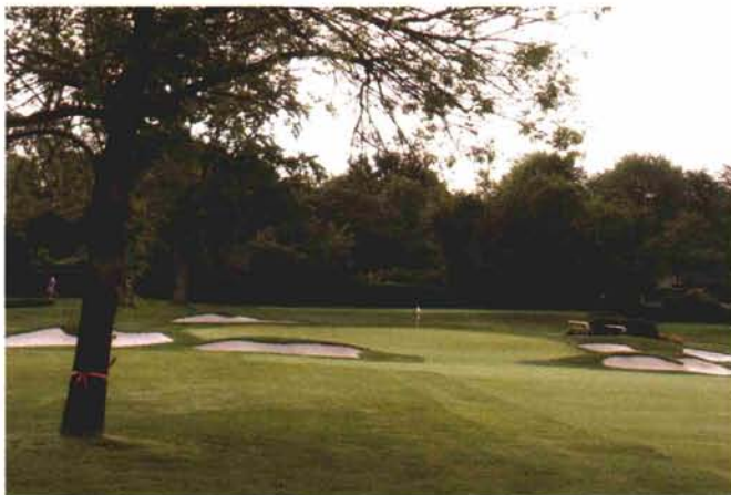
Note to trees at Oakland Hills: You lean, you fall, as indicated by the "Husqvarna-orange ribbon of death."