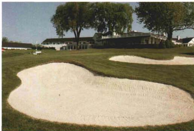
And the perfect score on the final exam . . .