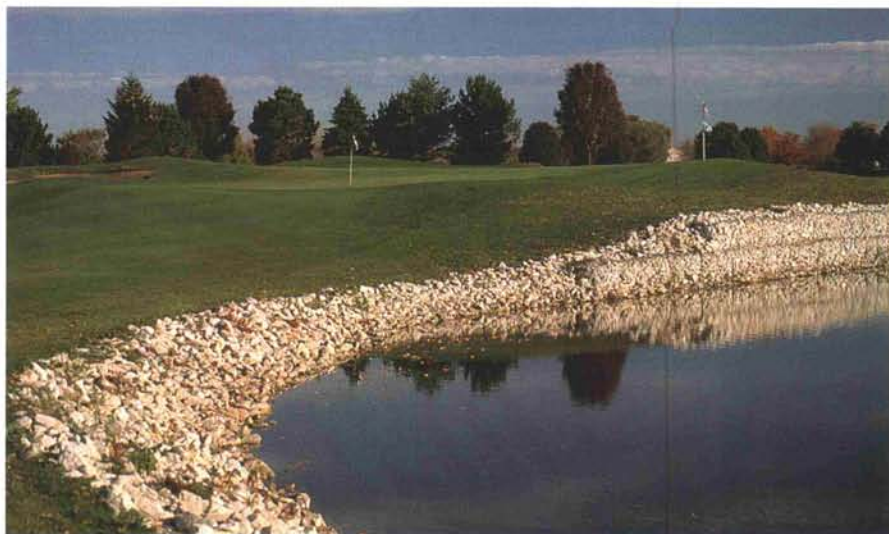
Going by handicap rating, hole no. 7 is the toughest at Seven Bridges.