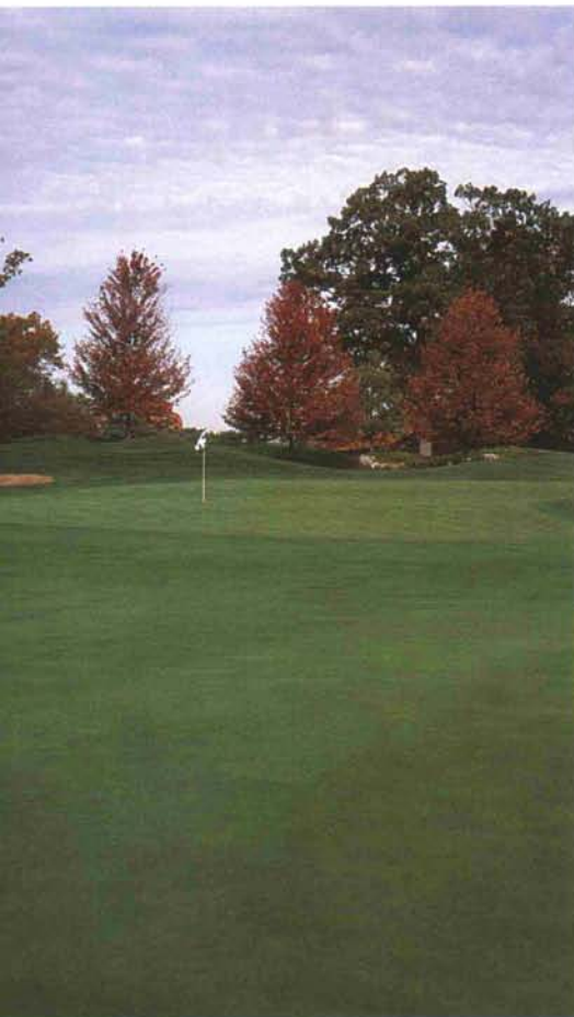
No. 17 green, the end of a long par 4.