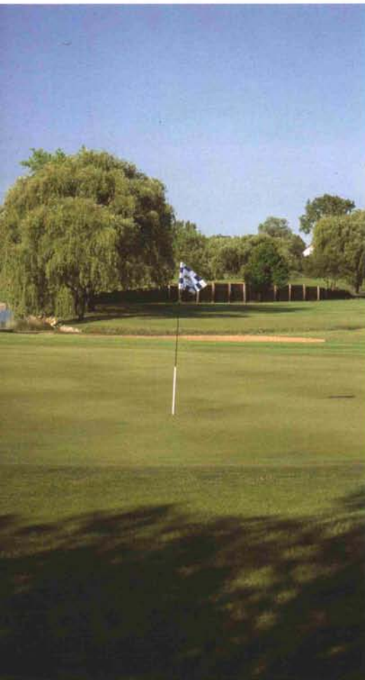
No. 10 green.