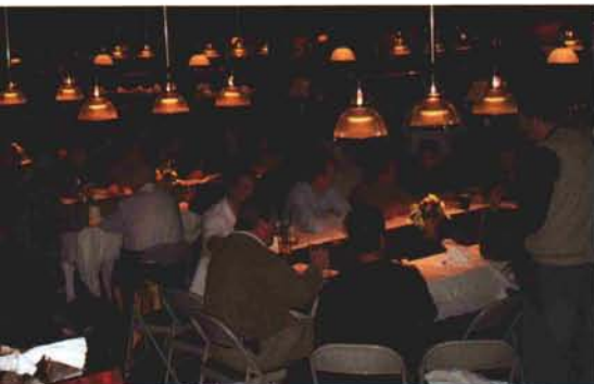
Let the feeding frenzy begin!