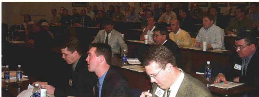
The attentive audience.