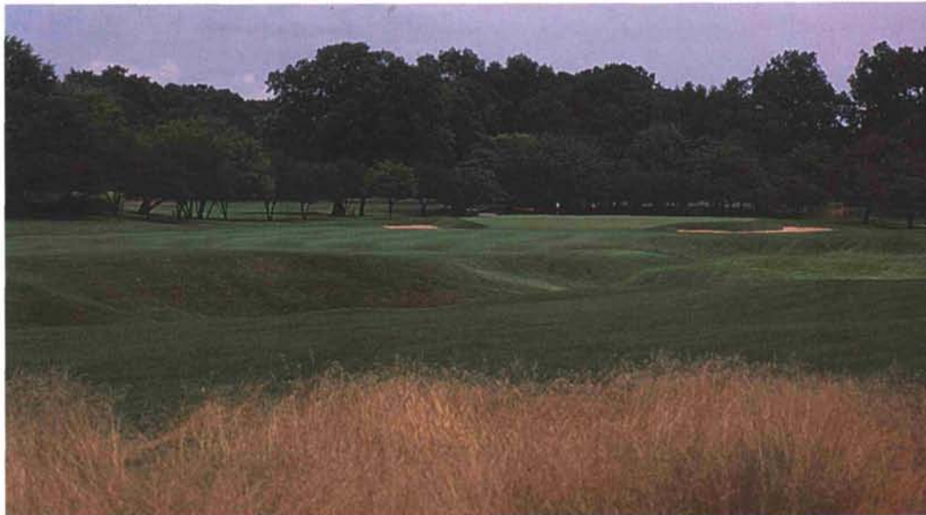
Hole no. 4, a 372-yard par 4.