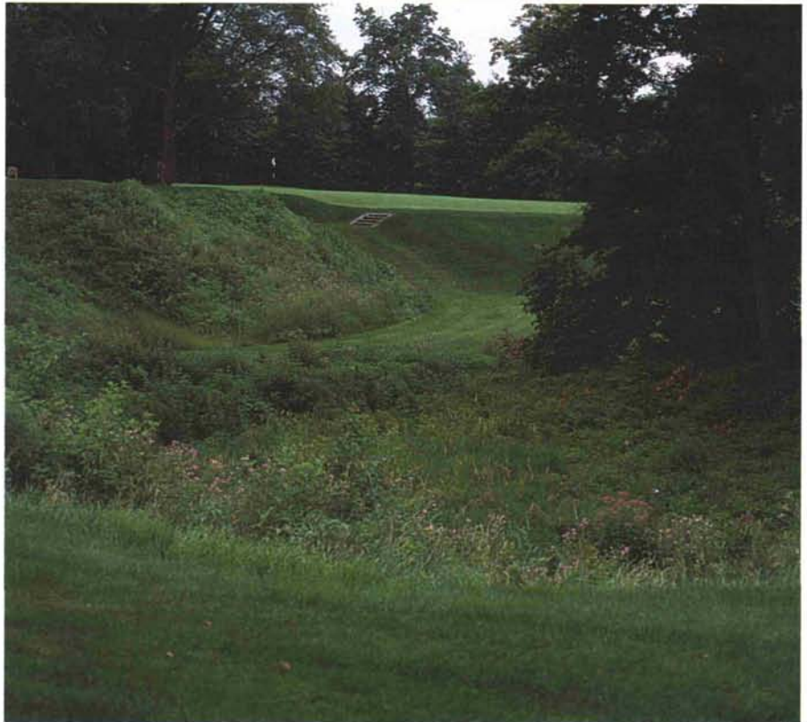
Par-4 no. 13 plays to 332 yards.