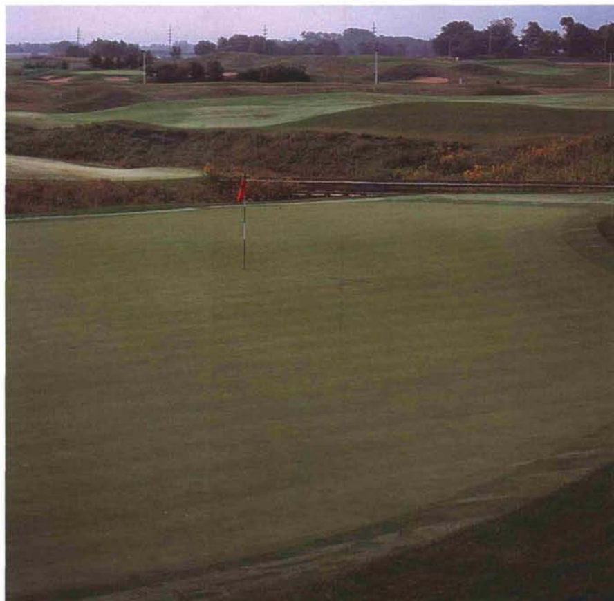
Prairie Landing offers plenty of "wide open spaces." Here, no. 7 green is the culmination of a 598-yard par 5.