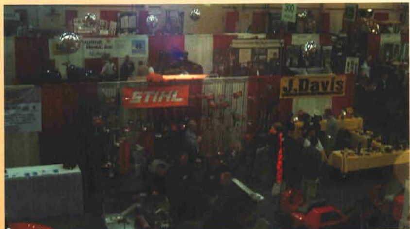
The trade show floor was where the action was.