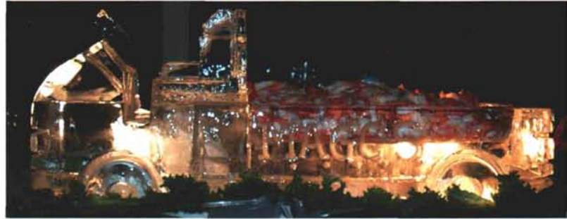
Not quite Club Car material, but this cart served its purpose well.