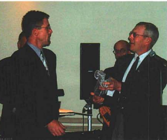
The president presents the host with an appreciation gift—a bottle of VERY fine wine that will indeed be appreciated!