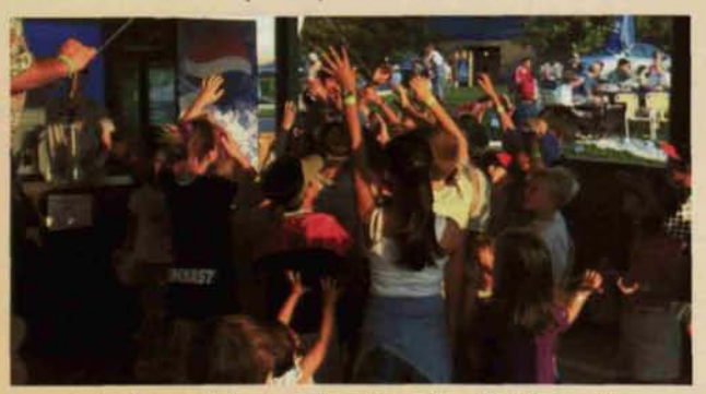
Not pictured, but under the pile—Ed Braunsky.