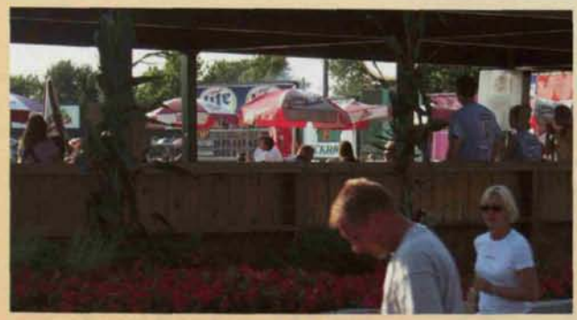
You know you're in the "sticks" when corn is used as an ornamental plant.