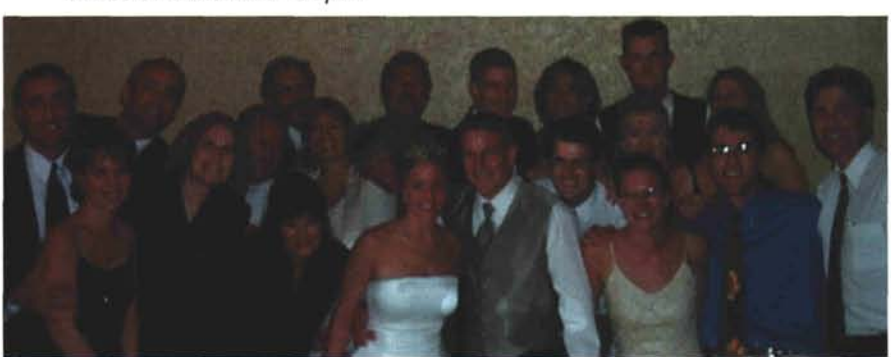
The MAGCS was well-represented but there were too many to name, so figure them out yourself.