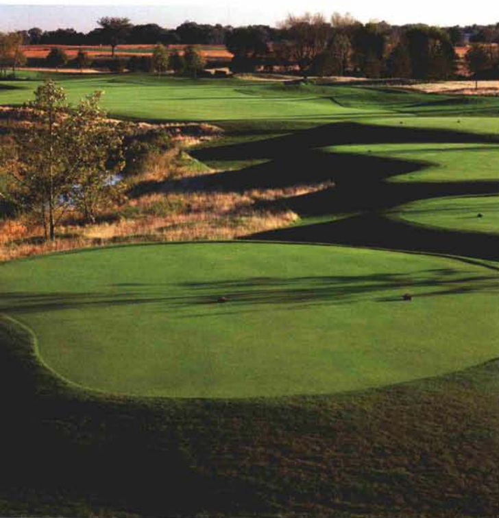
Hole no. 13.