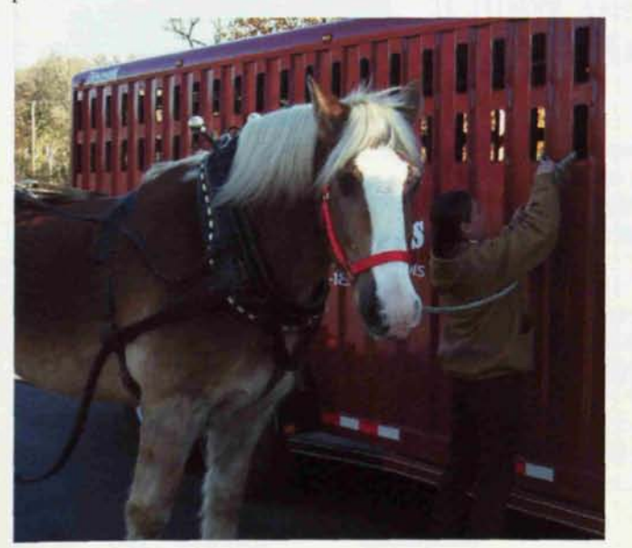
(1) – Ed, star that he is, arrives in his very own dressing trailer with personal assistant Joy from Jaynesway Farms an hour before the shoot.

With our grandiose plans in hand, we set about to create some "film magic." En route to achieving our final goal, we encountered many unexpected hardships hoity-toity models demanding dressing trailers and personal assistants, temperamental photographers, cost overruns, time constraints and a sun that would not sit still even for ten minutes while we attempted the shoot. As with every photo session, though, the snafus were quickly addressed and the day proceeded incident-free. Take a look at the following photo journal of the anatomy of a photo shoot . . .