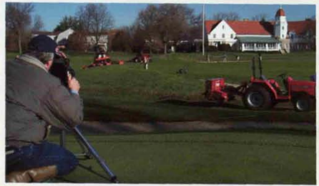
(3) – The next step is the shooting of a Polaroid of the planned finished shot to check for . . . I don't actually know, but it definitely WAS the next step.