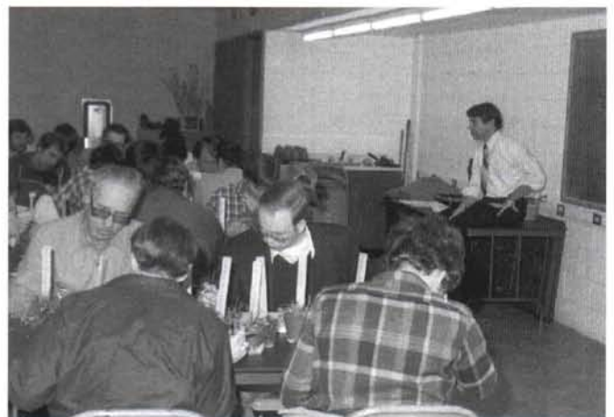
Historically, the NCTE's calling card has been its consistently outstanding education offering for the region's golf course superintendents and other green industry professionals.