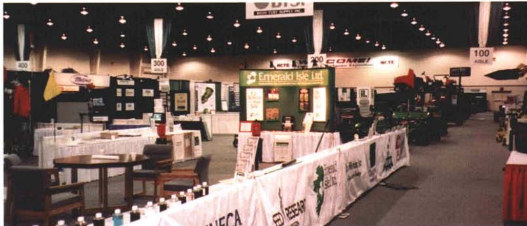
The NCTE trade show floor.