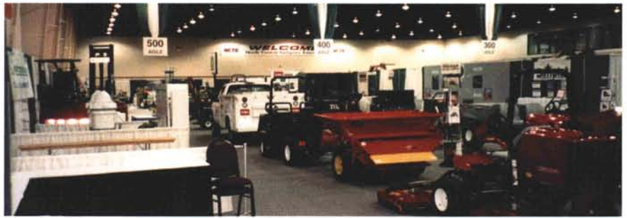
Pheasant Run offers an easy-in, easy-out show floor for NCTE exhibitors.

Attendance and revenue rose dramatically as the NCTE returned to the Chicagoland area. In 1987, the conference was moved to the Pheasant Run Convention Center in St. Charles, IL, where it is still currently held each year. The NCTE did return to Springfield at the Prairieland Con-