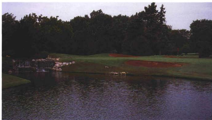
Hole no. 16, a par 3.