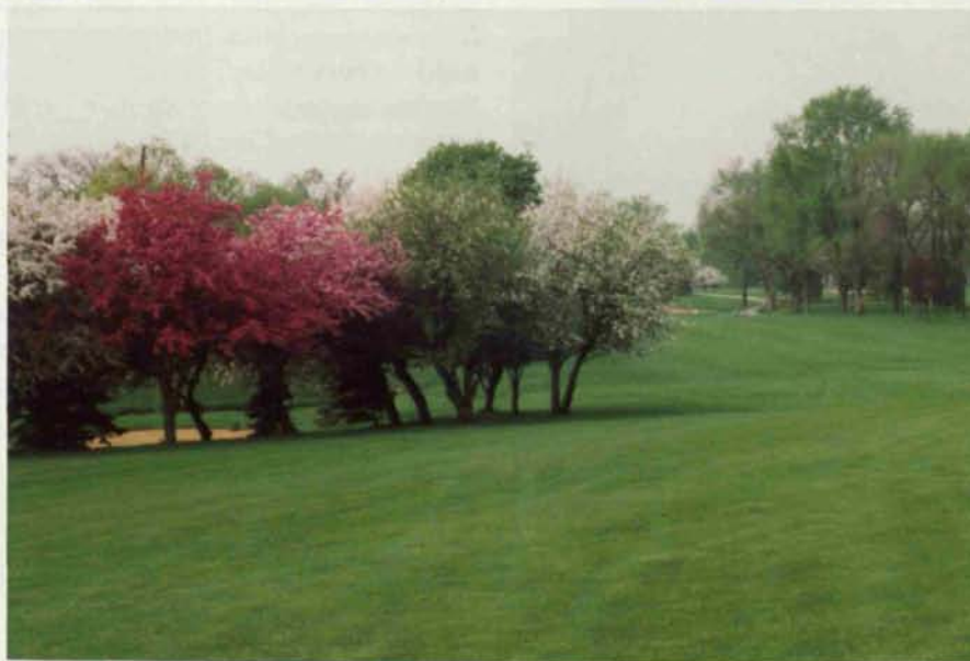
Spring photo of crabapples at dogleg on hole #12, a par 5.