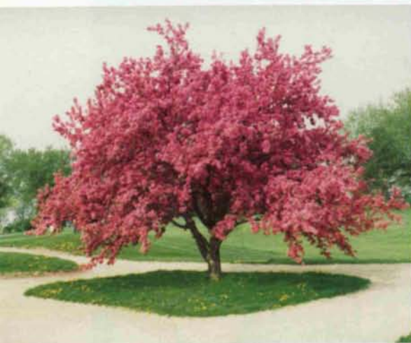
Weeping cherry in sand trap island on hole #14, North Course.