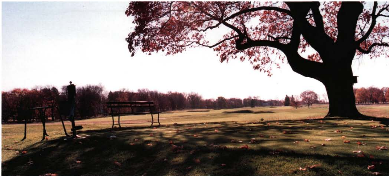
Hole no. 2 at Chicago Golf Club holds true to the original Charles Blair MacDonald design.