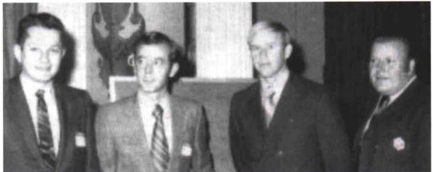
Can you identify these four superintendents? Hint: one of them is the editor's father, and one was a former salesman at George A. Davis. See answer below.

One further thought: a careful examination of the "Decades" series reveals that the history of the golf industry, and the green-keeping profession, is inextricably linked to world history. For example, the advent of television and specifically, televised golf, resulted in surging demand for access to the game, a plethora of new golf courses and many more opportu-