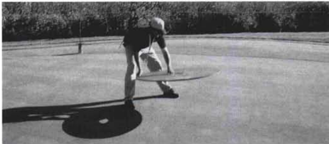
Intern Steven Craig places protection around the area where he will cut a cup.