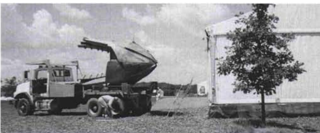
Landscaping around merchandise tent with native trees from The Merit Club's nursery.