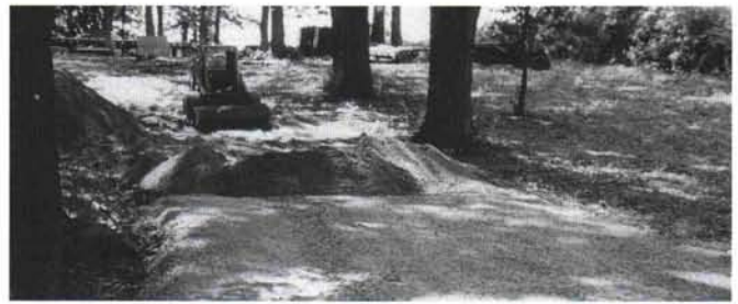
Construction of temporary access roads to parking areas was a priority. Now, crew are cleaning up and overseeding this area.