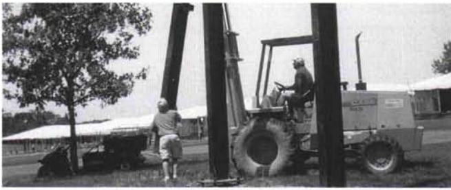
Straight from Pebble Beach: the Palmer Group erects the Monsterboard frame.