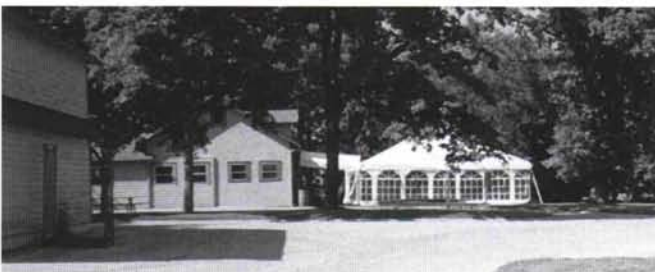
The staging area. Maintenance headquarters (L) with adjacent hospitality tent.