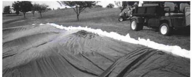
Here, plastic tarp and sandbags. The method worked well, but it was ultimately a moot point—Mother Nature was kind!