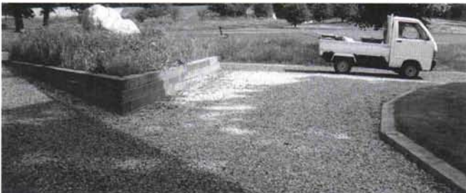
Sealing the service road to control dust.