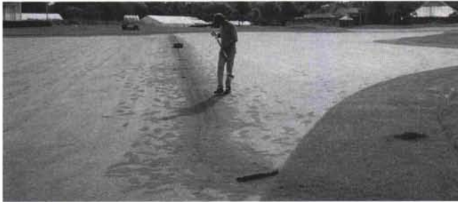
Crisis: hydraulic oil leak, #18 fairway, week of the Open.