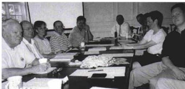
The Merit Club's Executive Committee for the 2000 U.S. Women's Open.