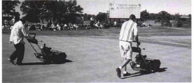
Rolling #18 green to achieve a speed of 12.