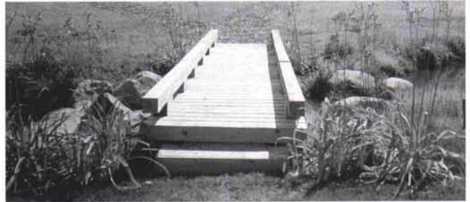
A lovely touch: special player bridge built behind #2 green.