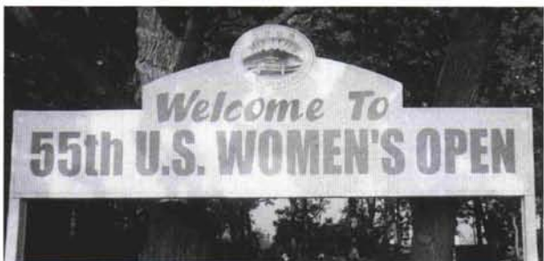
A picturesque, wooded entrance greeted spectators.