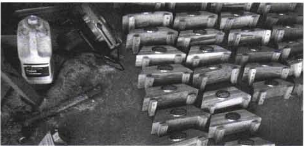
Custom tee markers created for the Open.

The Merit Club rose admirably to the challenge of hosting the women's premier Major.