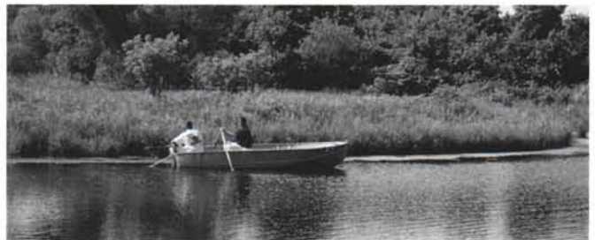
Applying Aquashade (a dye) to color the water and algae, #7 hole.