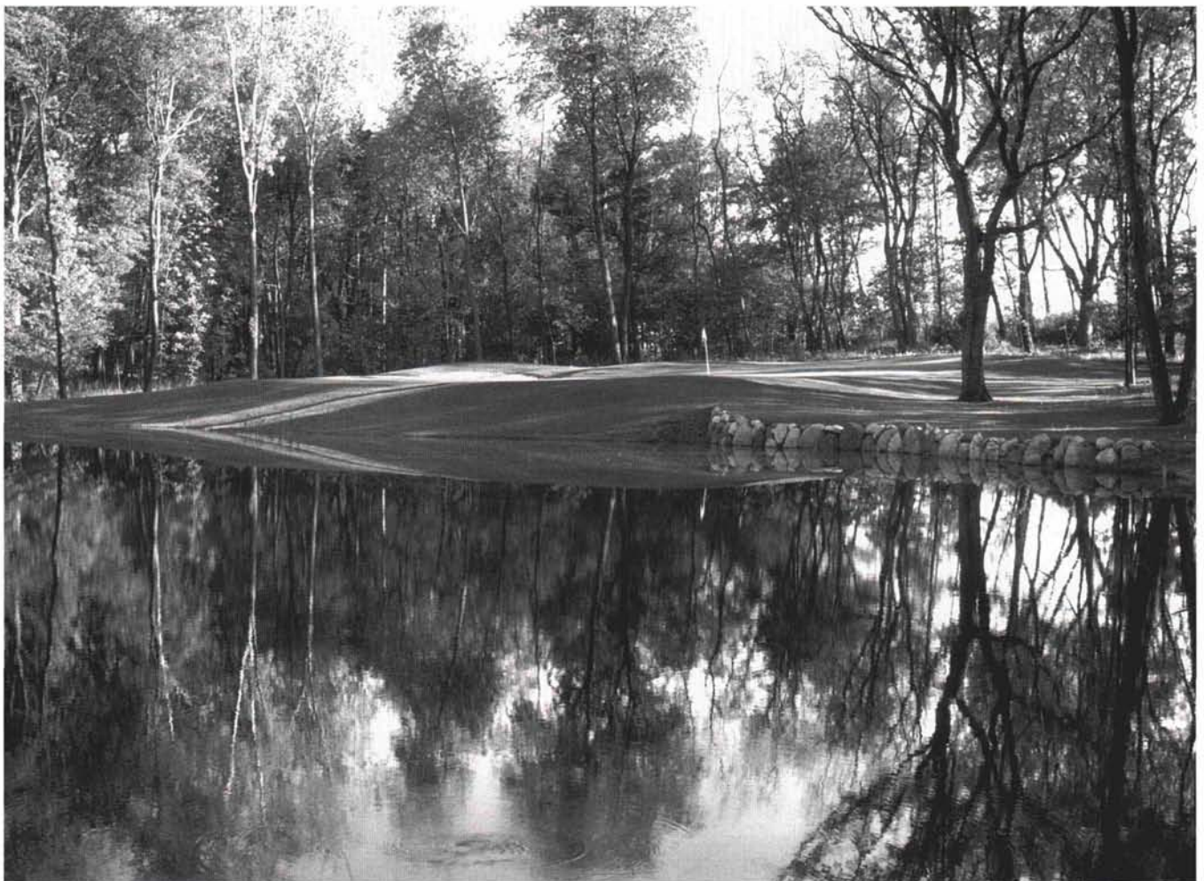
Another look at Bull Valley's signature hole, #13.