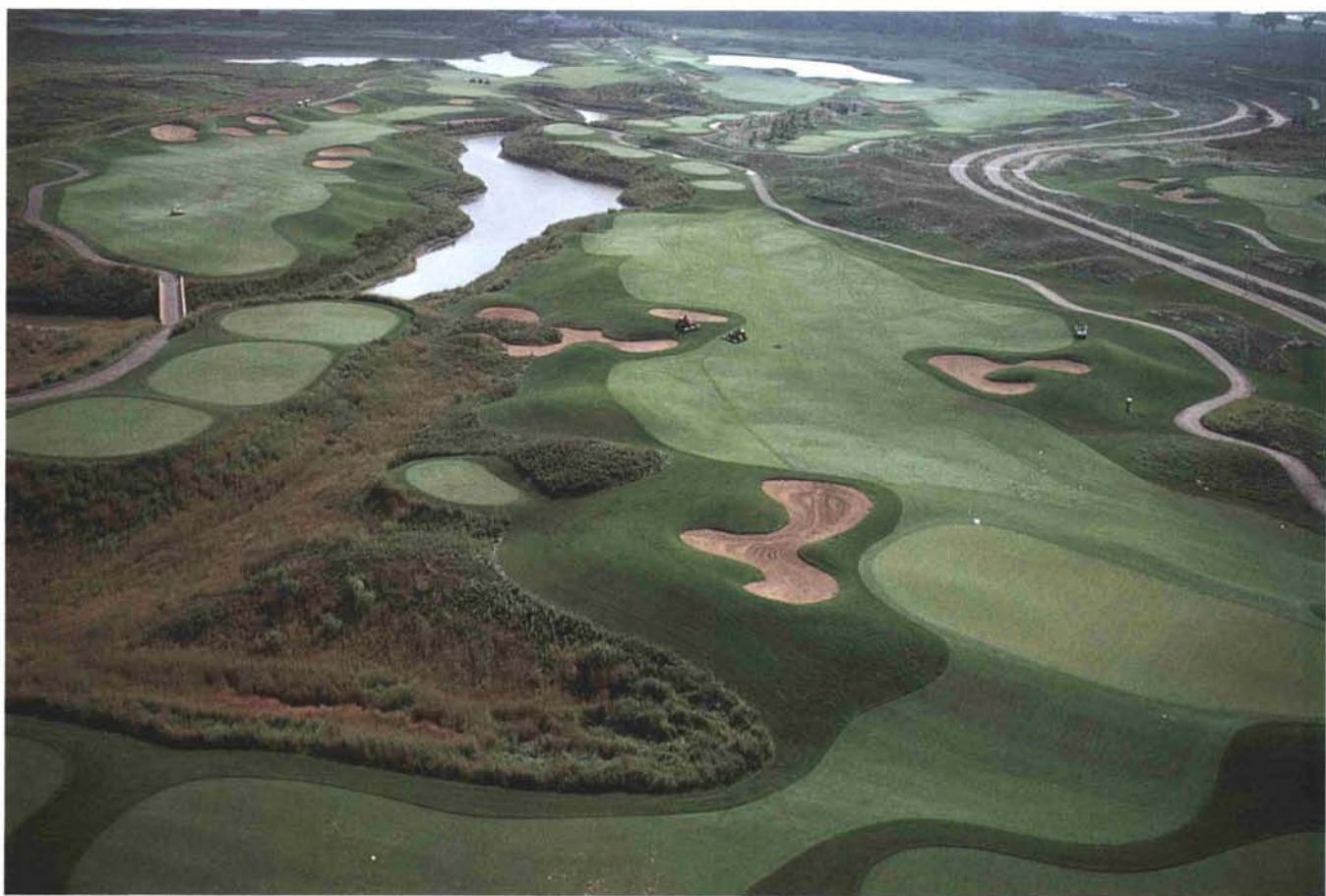
Aerial view of #8 hole, par 4, 375 yards on left, with #2, par 4, 367 yards on right.