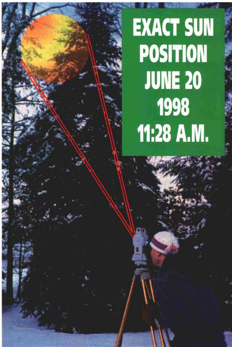
New technology allows the consultant to go onto a golf green in January and determine the position of the center of the sun in June within 1/16 in. at 200 ft. from the sun location instrument.