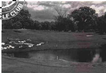
No. 6 hole of the tournament course.