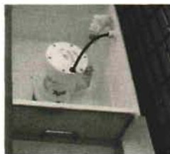
Computerized pump system keeps fluids within 1/4" depth, stainless steel removable screens filter large

EAGLE CONTAINER CORPORATION 4214 Rome West Rd. Chillicothe, IL 61523 Tel. (309) 274-5273 Fax (309) 274-4765