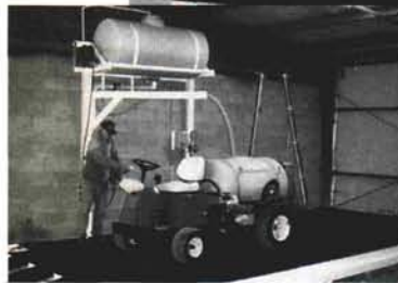
Environmentally correct process to reclaim tainted rinse water. Can be located anywhere

Continuous welded, solid steel construction will not crack like concrete. Each unit is coated with a chemical and UV resistant paint. With 16 standard sizes available ranging from 8' wide x 8' long to 12' wide x 20' long we can meet your needs.