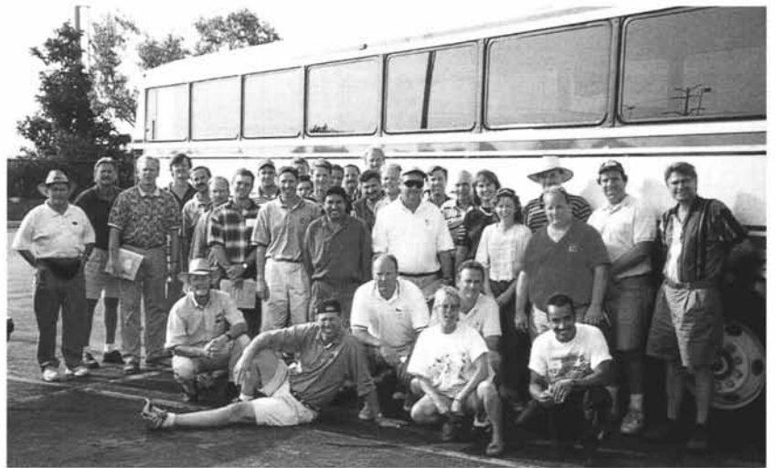
"The group who decided to take the bus—all 33 of them. Arthur Clesen, Inc. provided the refreshments on the bus.