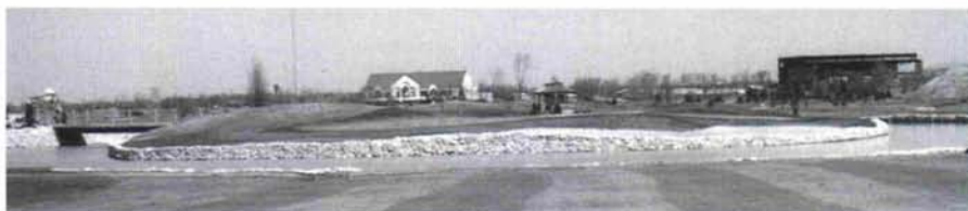
Island green, #16 hole, Odyssey Club.