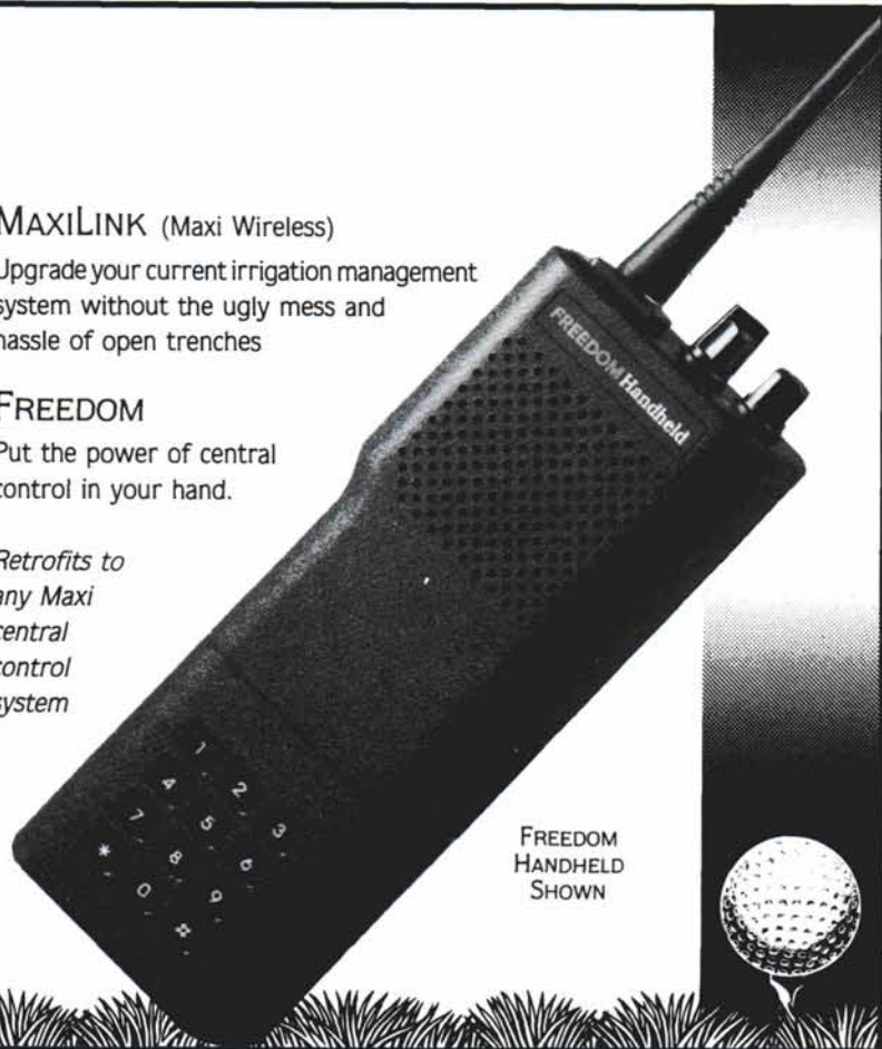
FREEDOM HANDHELD SHOWN

Retrofits to any Maxi central control system