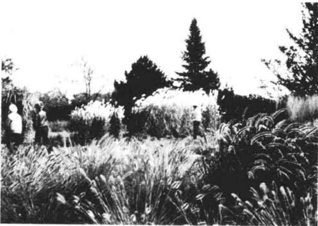
Table 2. Native ornamental grasses for use in naturalized or prairie areas.