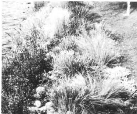
Table 1. Grasses for use near water.

Listed in Table 1 are grasses that can be planted along the edge of water. Spartina will tolerate some standing water; all tolerate wet and poorly drained soil. An attractive grouping near water would be giant miscanthus in the background with red flame miscanthus in the center and Feeseys form ribbongrass in the foreground.