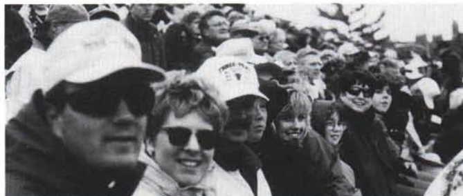
Wives, family members, and friends also attended the game.