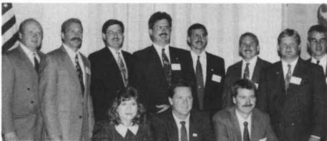
1995 Board of Directors