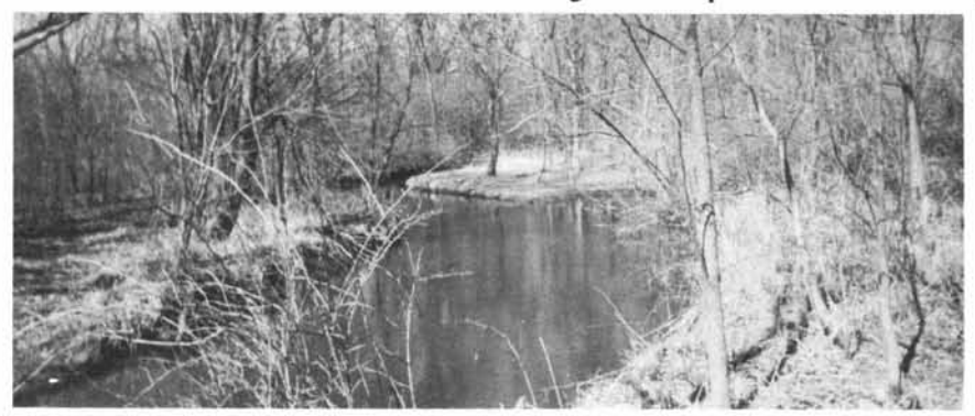
Norton Creek is just one of the features visited on the St. Charles Country Club Nature Walk. Many types of wildlife can be seen here any time of the year.

Our excitement here is bursting as each season shows us dramatic change on the Nature Walk. It is refreshing to see positive interest like this in our golf course and club activity rather than the paranoia expressed by some groups of conservationists who claim golf course operations can cause damage to the environment. I believe programs like ours can be implemented by any golf course whose "suburban woods" offer ecology and habitat for all kinds of "fern and fauna". I perceive this project to be one that will help our golfing membership appreciate more of the work going on at the course. The nature walk concept is a wonderful public relation tool that can awaken people to the fact that the golf course is a real asset to the community. Not only will the project stimulate topics for articles in local publications and newsletters, but it will help the golf course superintendents expand their knowledge about so many things that take place around them every day and every season.