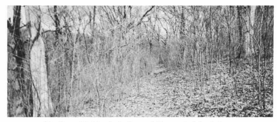
The Nature Walk begins in the woods just north of the clubhouse. The routing is \frac{2}{3} of a mile and can take as little as 20 minutes to enjoy.

Having just about completed one full season of work with the Nature Walk, we can safely say that the project has been a success as well as a learning experience. We have had more (cont'd. page 26)