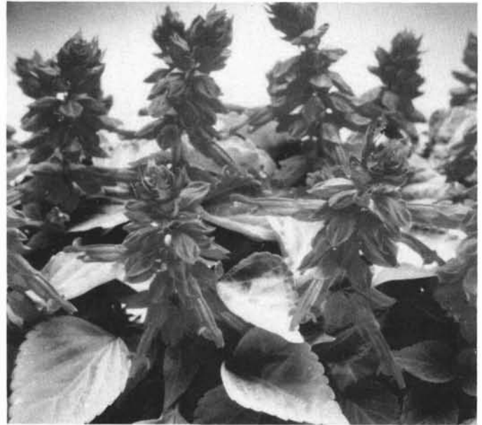
Salvia Sizzler Red

SALVIA SIZZLER SERIES is a tremendous garden performer with a wide range of flower colors available. Bred for its early flowering and uniform compact habit ... the deep green foliage contrasts beautifully with the flower spike color. Can be used in shade (if placed there already in bloom), partial shade (morning sun and afternoon shade), or full sun. Expect some flower fading during mid summer heat if used in full sun. Should be used on 6" spacing.