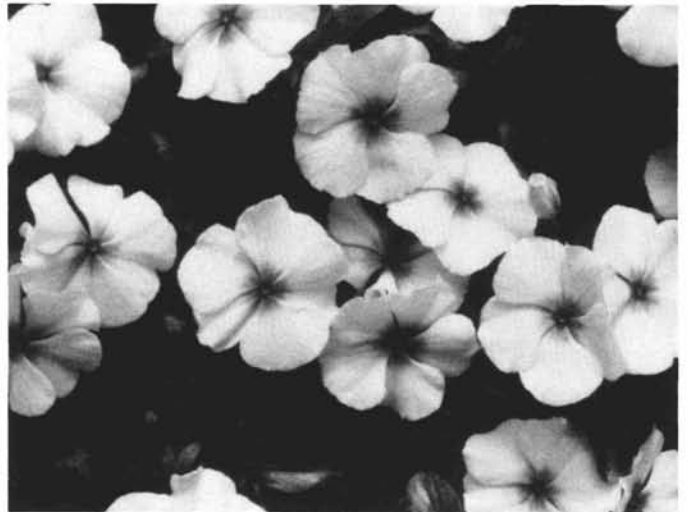
Vinca Blush Cooler

VINCA BLUSH COOLER has a tremendous branching habit and the unique blush pink petal with a rose eye. The performance in the golfscape is exceptional! Loves all the full sun and heat that the midwest can dish out! Should be used on 4" spacing. Pay special attention to the overlapping petals.