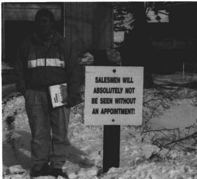
"There's a new salesman in town, keep your eyes open"

The Cooperative Sanctuary Program for Golf Courses, and the partnership with the USGA and the GCSAA is certainly a tremendous way to start off the new year.