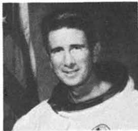
James T. Irwin

Col. Irwin was selected as an astronaut by the National Aeronautics and Space Administration (NASA) in 1966. Following months of astronaut training, he was assigned to be a member of the astronaut support crew for Apollo 10 and then backup lunar module pilot for Apollo 12. On the Apollo 15 mis-