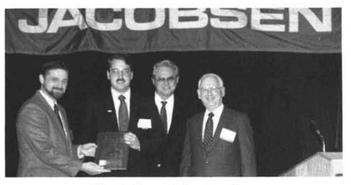
Illinois Lawn Wins Jacobsen Distinguished Service Award

Racine, WI — The Jacobsen Division of Textron announced recently that Illinois Lawn Equipment , Co., Orland Park, IL, was a recipient of the Company's Distinguished Service Award. The honor, given for outstanding performance and service support of Jacobsen professional turf equipment, was presented at the annual Jacobsen Distributor Awards Breakfast held during the International Golf Course Conference and Show in Anaheim, California.