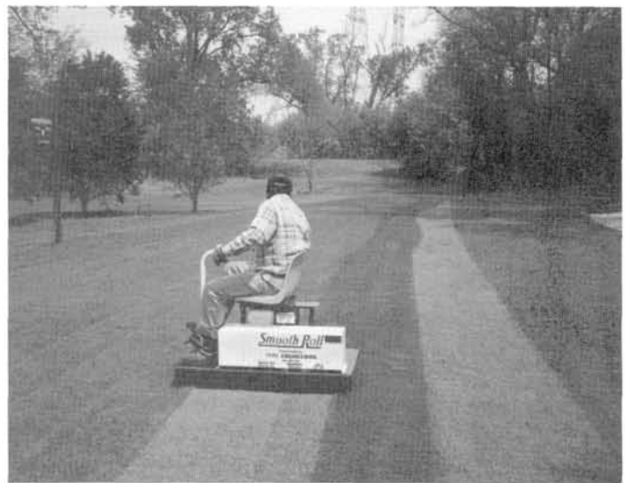
Ismael Estrada rolling new sod at Glen Oak C.C.

I look at this machine as just another toll in our inventory needed to keep pace with the demands of our jobs. Just as we have coring machines, turf groomers, and top dressers, a roller is another tool to be used to do a critical, required task.