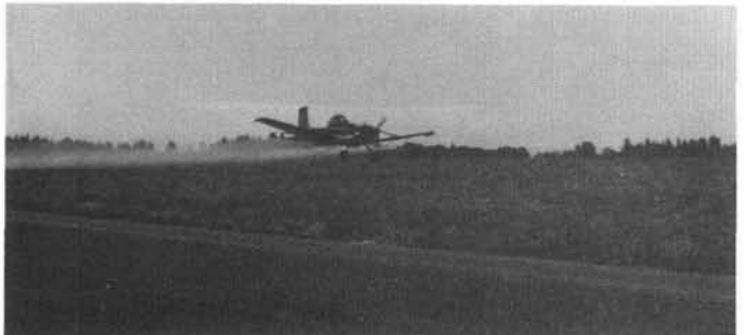
8. A crop spraying plane that sprays 5 gallons per acre and can do 40 acres per load. The plane has a 275-gallon capacity.