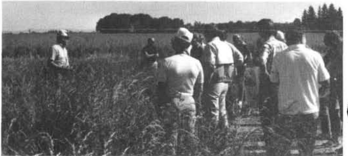
9. Standing in a field of tall fescue that will be harvested this year.