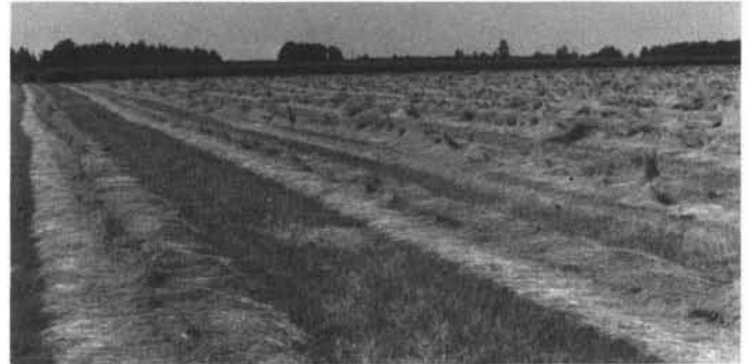
13. A field that was just swathed in preparation for seed harvest. The field is swathed first and left to dry for "x" number of days, depending upon the humidity and sunlight. Then the large harvesting machines go up and down the swathed rows picking off the seed.