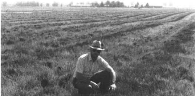
11. Your Editor checking Pennlu in a field of Penncross that will be harvested this year. You can spot Pennlu; being a darker color, it stands out. It is planted every third row, as you can see as you look across the field.