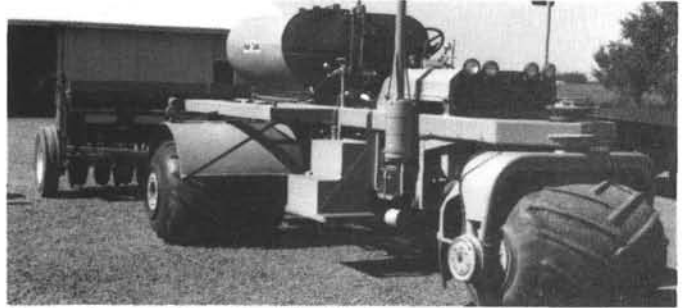
6. Another "Rubber Duck" with the seed disc behind. The tank would hold the charcoal slurry to be sprayed over the seeded rows.