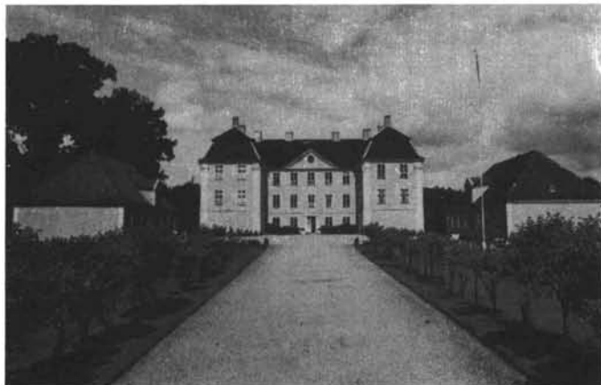
Christinehof, the mansion where ghosts nightly held forth.