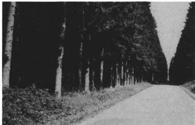
The forest I planted when just in grade school.

day, those plants are mature trees ready to be harvested. After graduating from grade school I secured employment as a gardener apprentice at Christinehof; a large estate with the corps de logis being built during the latter part of the 17th century and owned by Count Piper. In order to be accepted at any professional school, forestry, gardening, agronomy, three — four years of practical experience were mandatory for the applicant and I was no exception. Besides myself there were 3-4 other apprentices under the direction of a graduate head gardener. There were conservatories for grapes and peaches, and also for flowering plants. Considerable acreage was covered with nursery stock, perennials and vegetables. The area around the mansion was terraced with walks, turf and flower borders. Because of a rather harsh climate, grapes and peaches were