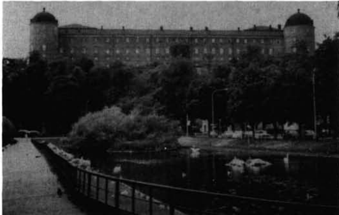
Uppsala, ancient castle, birthplace of Mr. Hammerschild — president of the United Nations.

some 700 years of being the cultural center of Sweden. The University was founded 1472, and Carl Von Linneus, the father of the botanical science worked in Uppsala and founded its first botanic garden where I often studied. A statue of Linneus has now also been erected at the Chicago Botanic Gardens. After two years with the parks in Uppsala including annual studies from November until April at Tarna Folk High School, upper division I left to attend a private university that would shorten the time to graduation. During the years of apprenticeship; — if you changed employer, a letter of recommendation was required from the previous employer. The recommendations covered industry, knowledge and general comportment; — if the recommendations were below par — no employment. I loved Uppsala, the parks, the buildings and the great mounds holding