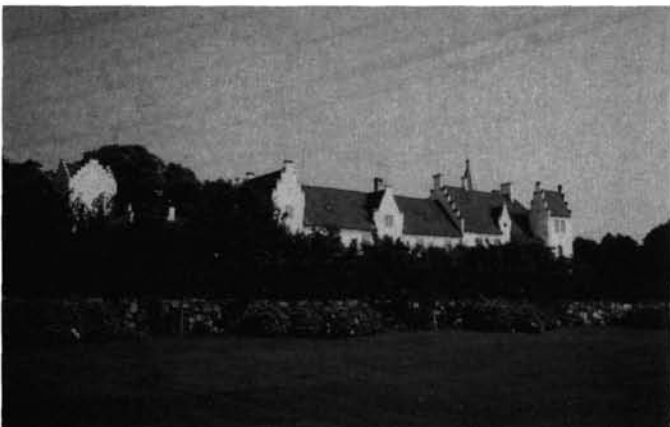
This estate — Bosjokloster, dating back to year 1200 — and owned by Count Bonde, has an 18-hole golf course. There are numerous golf courses in Sweden, but frankly, the Swedes are much better on ice than on grass. (cont'd. page 20)

the bones and weapons of the Viking Kings of long ago. The students gave the city an air of youthfulness and eternity. By the time I was through with my preliminary studies it was almost time for induction in the Army; — not just as a conscript, but as a student with extra time added to become an officer in the reserves. This did not appeal to me; — had debts to pay and wanted to get ahead in the world. My parents lived in upper Minnesota. My father was a woodsman, sawyer, farmer and hunter, — naturally U.S.A., was my destination. Late 1925, the King of Sweden granted my permission to leave. I had no difficulty getting passage to U.S.A., or to clear Ellis Island. Almost immediately I was employed by a Landscape firm in Manning Brown, Mass. This firm was landscaping the estate