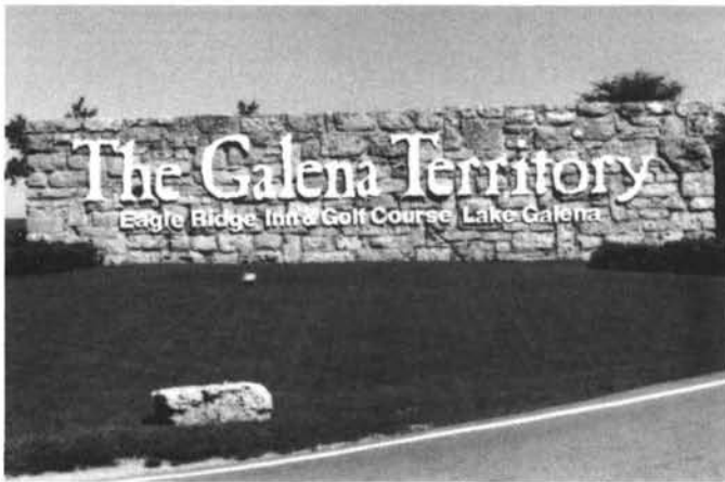
Site of the Joint Association Meeting May 19, 1986