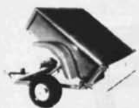
Optional Dump Box

Quick and Easy No Tearing Deep Penetration Low Maintenance Close Hole Spacing