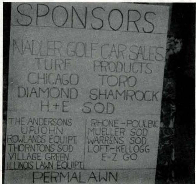
III. Turfgrass sponsors at Indian Lakes C.C.