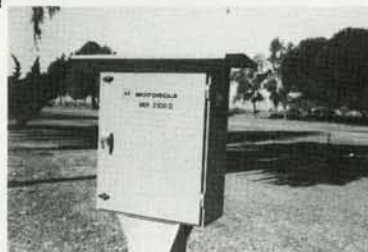
MIR-2100 FIELD UNIT ON CITY OF LOS ANGELES ENCINO GOLF COURSE

WORLDWIDE LEADER IN ELECTRONICS SINCE 1928.