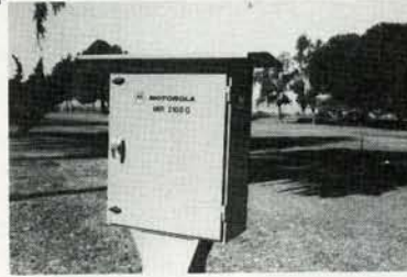
MIR-2100 FIELD UNIT ON CITY OF LOS ANGELES ENCINO GOLF COURSE

WORLDWIDE LEADER IN ELECTRONICS SINCE 1928.