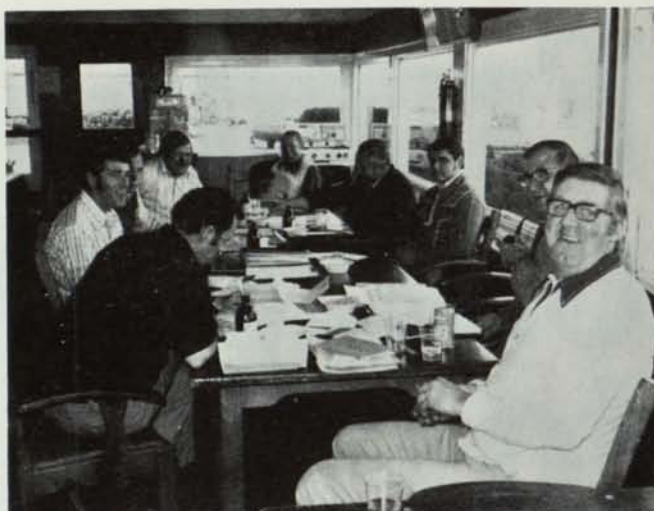
Midwest Board of Directors in action.