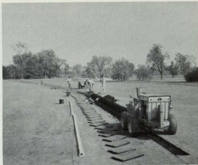
It appears, each golf club and contractor installing an automatic irrigation system have their own idea. These three pictures represent three different clubs.

1106 N. Scott Street Wheaton, Ill. 60187 Telephone 668-5537