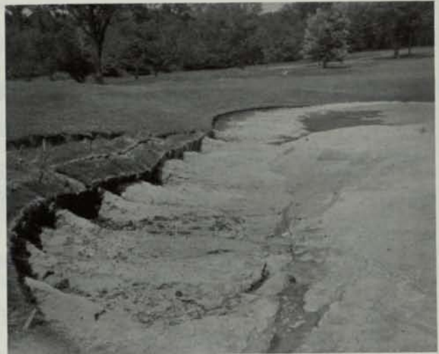
Sand traps like this were numerous after the seven-inch rain August 25th.

"Idleness is the hot-bed of temptation, the cradle of disease, the waster of time, the cankerworm of felicity. To him that has no employment, life in a little while will have no novelty; and when novelty is laid in the grave, comfort will soon follow."